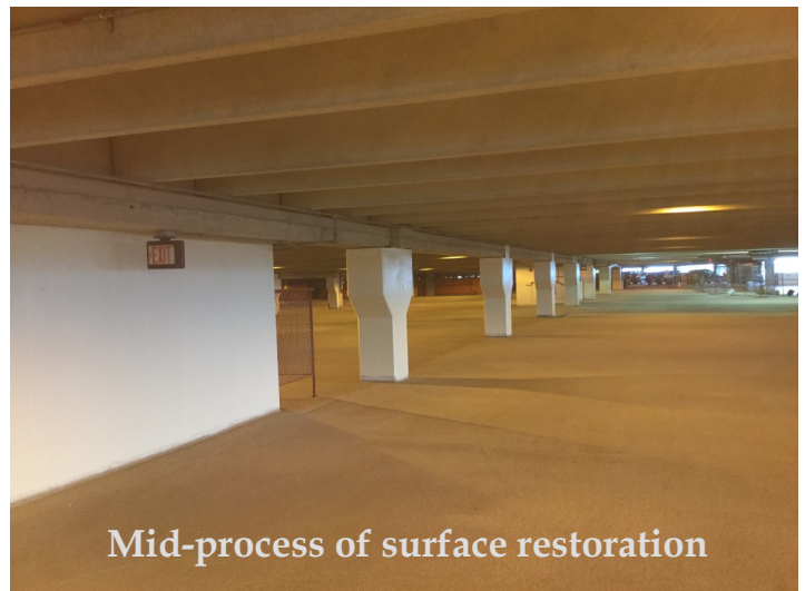
Mid-process of surface restoration